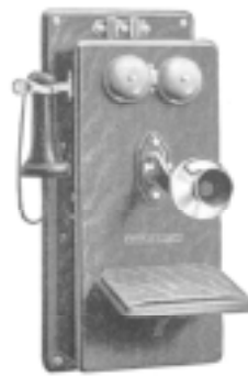
Local Battery Telephones

Same size as old batteries, with knurled Screw Terminals and a plastic case (instead of cardboard)