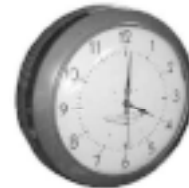
Western Union Self Winding Clocks